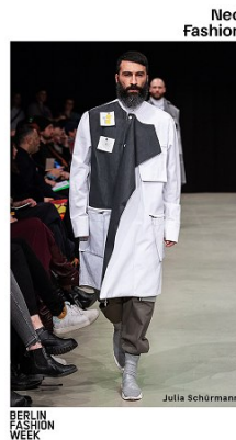
BERLIN FASHION WEEK