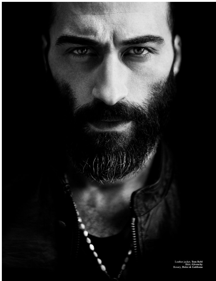
Leather jacket: Tom Rehl Shirt: Givenchy Rosary: Dolce & Gabbana